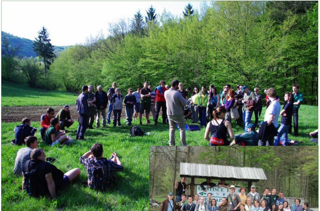
SERM participants during an excursion

„We invited some professors who prepared interesting topics on forest fires and how to restrict them with...“