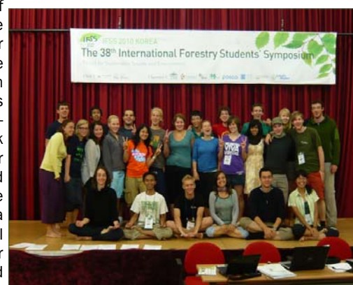
IFSA officials 2010-2011 at IFSS

forestry in order to meet the diverse needs of public and private sectors and to develop advanced and environmental-friendly technology for forest management. The division of Genetic Resources of KFRI which is located in Suwon , is not only conducting the development of fundamental plant sciences but also the reservation of diverse plant genetic resources. The tour was designed to showcase KFRI's researches on exploration, evaluation and conservation of forest genetic resources to manage the forest genetic resources at national level.