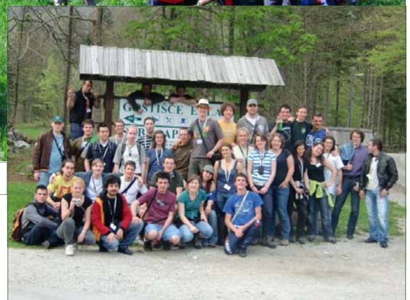
Group picture of IFSA SERM participants

On the last day we visited the virgin forest until it was time to drive back to Ljubljana. In the evening the participants had the chance to go the city centre or stay