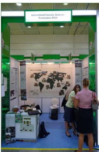
IFSA booth stand

The International Union of Forest Research Organizations (IUFRO), is a non-profit, non-governmental international network of forest scientists. IUFRO promotes global cooperation in forest related research and enhances the understanding of the ecological, economical and social aspects of forests and trees.