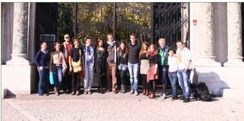
Group picture of the IFISO participants in Istanbul

represented 12 student organisations. Seven of these organisations are functioning on European level like EPSA (European Pharmacy Students Association) or BEST (Board of European Students of Technology), and five are globally active like IAAS (International Association of Agriculture Students) or IFMSA (International