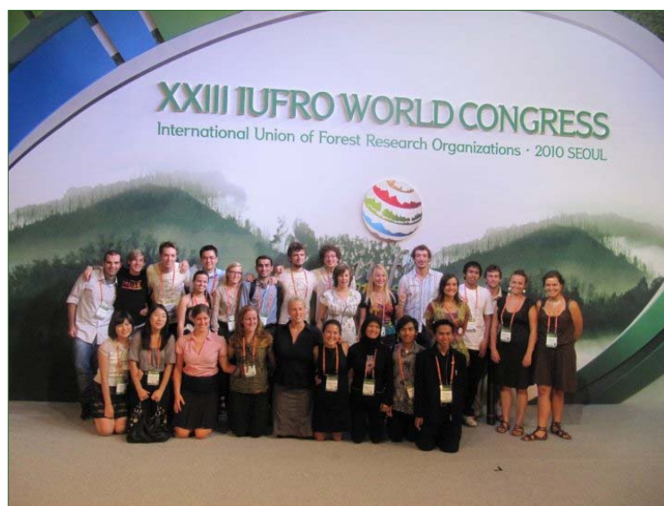
IFSA delegation at IUFRO

„Knowledgeable and competent graduates are crucial for professional success in forestry and related fields as well as for successful research...“