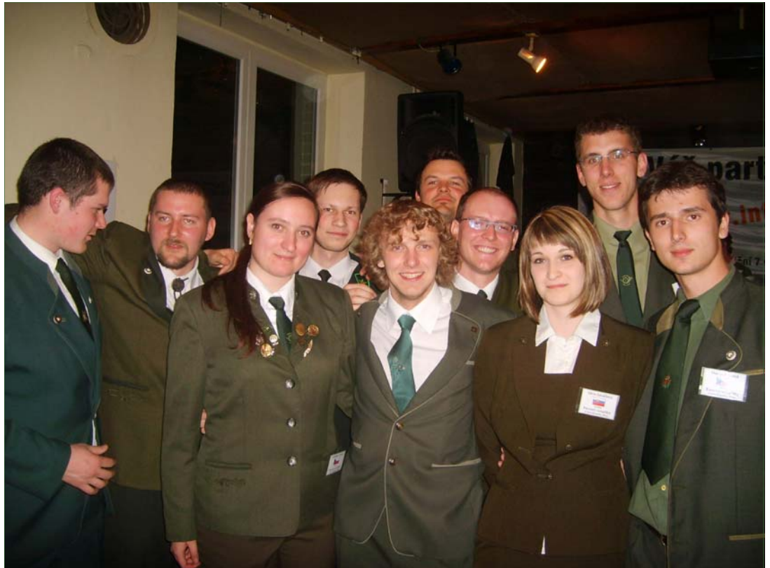
Forestry Versality host students from Mendel University in Brno

During the international evening, which is a trademark for IFSA events, we travelled around the world and enjoyed a glass of local spirit with friends over some traditional cuisine.