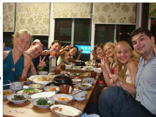
IFSA students enjoying South Korean food

„It was a great opportunity not only to know the history of Korean forests but also to visit the great...“