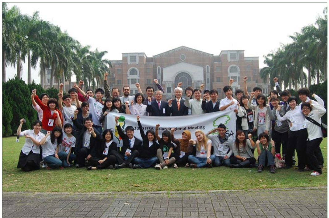
Group picture of IFSA ARM participants in Taiwan

“That was really a great opportunity for all organizing committee members to get valuable feedbacks...”