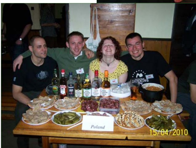
The team from Poland at the international evening

The 24 th Forestry Versatility Programme was a great adventure for both the organizers and competitors. The final positions of the competing teams were: first