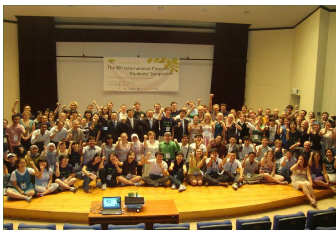
IFSS group picture of all participants

„The South Forest Research Station with its 16,218 ha is the biggest among 3 other research stations at ...“